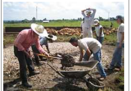
Volunteers at work in Osia - Tororo